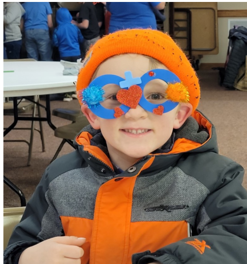
Youth participating in the monthly religious education family night model their “eyeglass creations.” The lesson for the evening focused on being the “eyes” of Jesus: to be observant and aware of the needs of others in our community. By doing so, and by helping others we are helping Jesus.